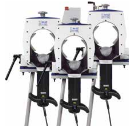
RA 12, RA 12 AVM, RA 12 MVM