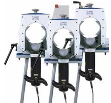
RA 8, RA 8 AVM, RA 8 MVM