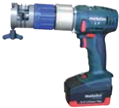
RPG ONE Cordless