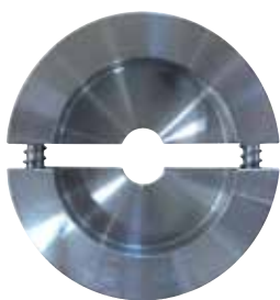
One-piece stainless steel clamping shell for micro fittings