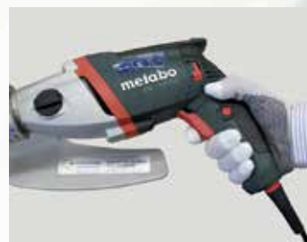
Speed regulated electric motor