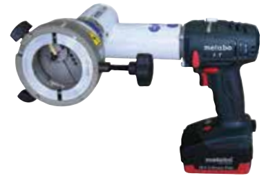
RPG 2.5 Cordless