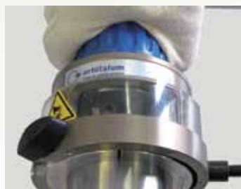
Exact results due to micrometer/inch feed