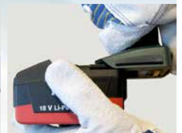
Environmentally friendly cordless versions thanks to lithium-ion technology and AIR-COOLED technology for short charging times and long service life