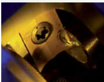
Burr-free and square

The required, high-quality tube end preparation for orbital welding!