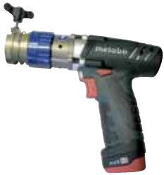
RPG XS Cordless