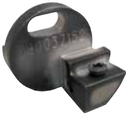
Tool holder WH

Fits multifunctional tool 790 038 314 . incl. Torx fixing screw. For max. wall thickness 3 mm (0.118 inch).