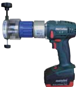
RPG 1.5 Cordless