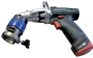
RPG XS Cordless angle drive