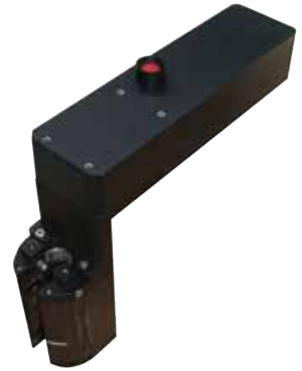
Open weld head HX 16S

To be able to operate the weld heads, clamping jaws and a suitable earth cable are also necessary, which are not included in the standard delivery and must be ordered separately.