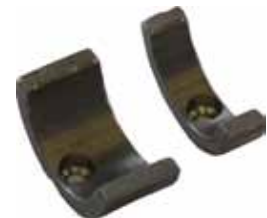
Clamping jaws for HX16