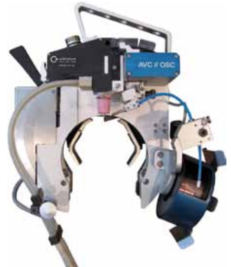
ORBIWELD TP 400 AVC/OSC

Please note that the weld head needs for operation an earth cable as well as a control cable that must be ordered separately.