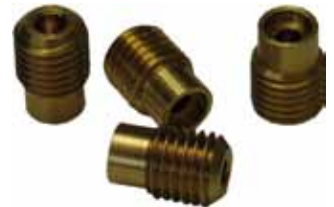
Plunger for clamp sleeve