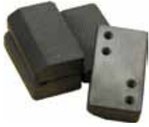
Expansion clamping shell set for ORBIWELD TP 250