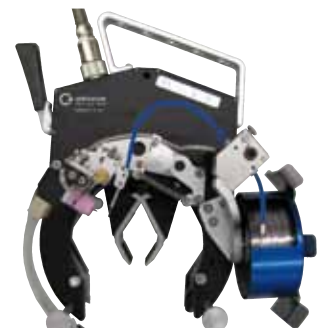
ORBIWELD TP 400 with KD 3-100 cold wire feed