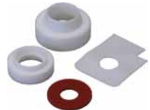
isolator seals and torch seals