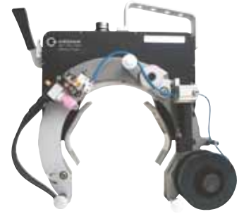
ORBIWELD TP 600 with KD 3-100 cold wire feed

Please note that the weld head needs for operation an earth cable as well as a control cable that must be ordered separately.