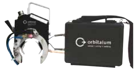
ORBIWELD TP 250 with external cold wire feed KD 4