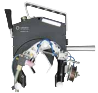
ORBIWELD TP 400 with KD 3-62 cold wire feed