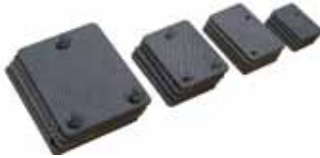
Additional clamping stainless steel shell sets for ORBIWELD TP