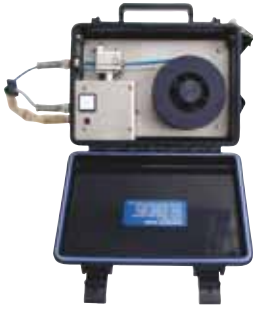
KD 4 with open lift-off lid