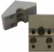
Clamping shell set for ORBIWELD TP 250