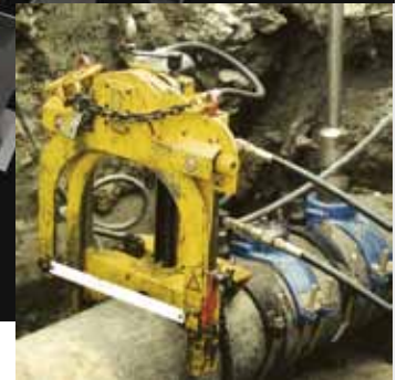
Long blade life