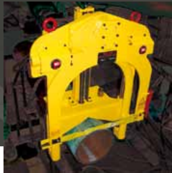
Quick cold cuts, minimal clearance