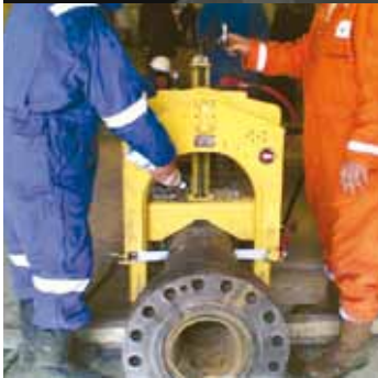
Easy setup, vertical or horizontal

Fast setup and cutting, both horizontally or vertically.