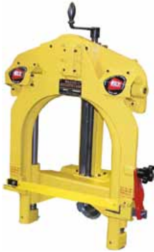
E.H. WACHS Guillotine