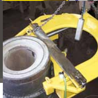
Portable, rugged design